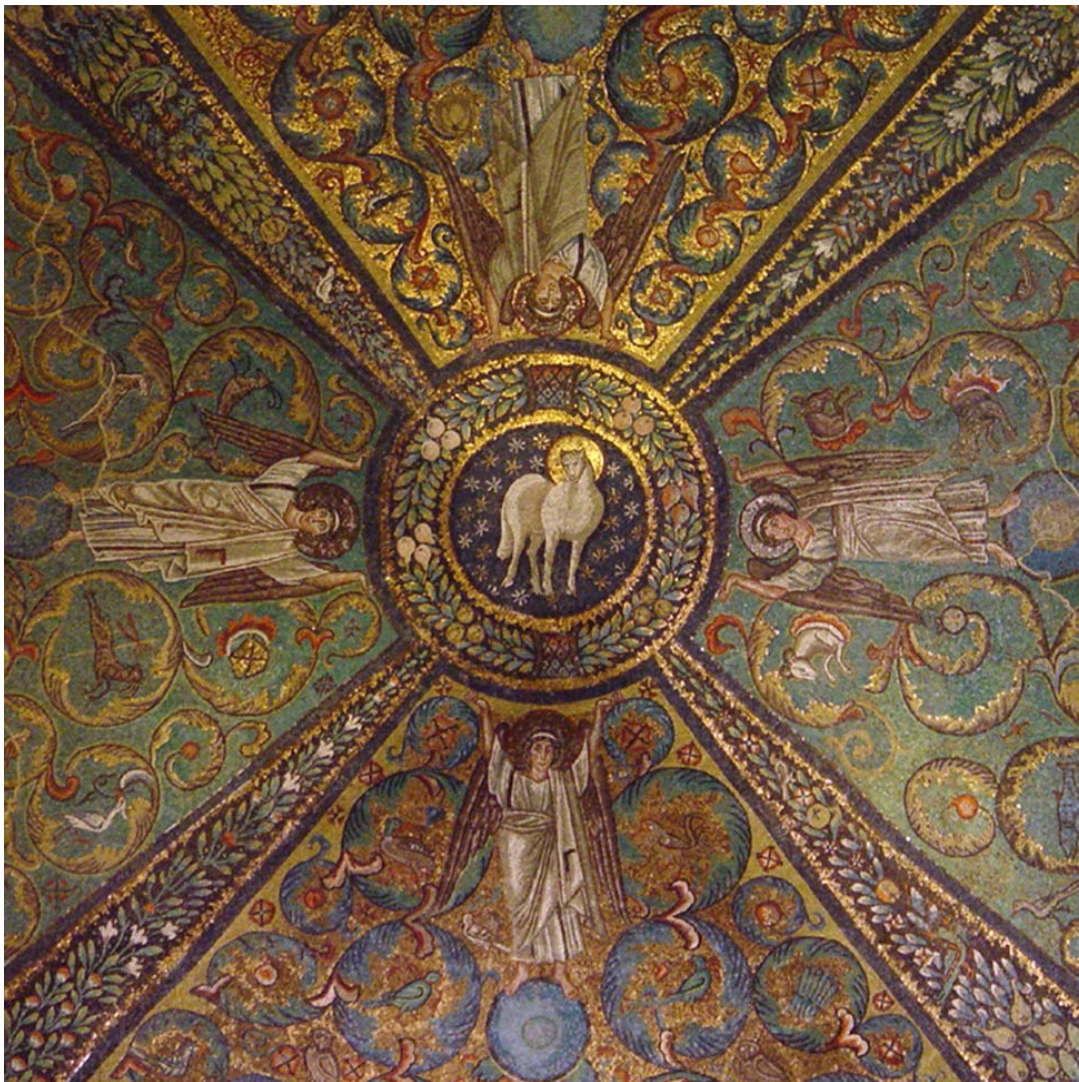
Agnus Dei - Lamb of God Basilica di St. Vitale Ravenna, Italy

JANUARY 15, 2017 | SECOND SUNDAY IN ORDINARY TIME