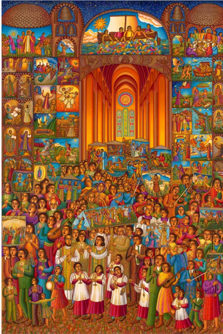
The Procession John August Swanson (1982) The original of this serigraph hangs in the Vatican Museum's Collection of Modern Religious Art

JANUARY 22, 2017 | THIRD SUNDAY IN ORDINARY TIME